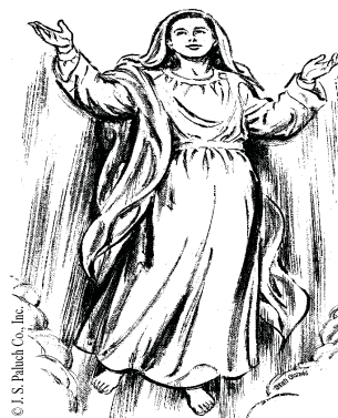
Assumption of the Blessed Virgin Mary

Bulletin Information —Articles for this church bulletin must be submitted by Tuesday at noon to appear in the following Sunday edition. Articles can be dropped off at the Parish Office or submitted through e-mail at bulletin@holyspiritunion.org . As always, articles will be published as space allows